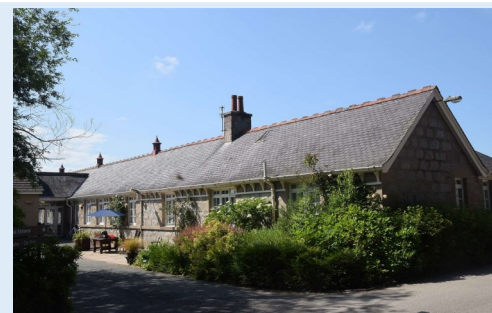
Insch Community Hospital

There is news of more community hospitals being surgical hubs in order to help with the waiting times for surgical procedures as a consequence of the pandemic.