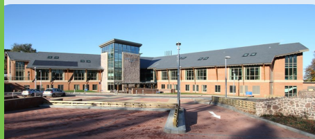
Malvern Community Hospital

Many more hospitals are featured on our news page including: Crowborough hospital, Finchley hospital, community hospitals in Shropshire and Malvern community hospital. There is also news from Penrith in Cumbria, Hawkhurst in Kent, and Falkirk in Scotland.