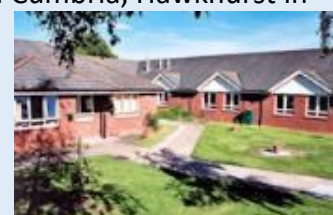
Dean Barton Community Hospital

There is good news from Rothbury community hospital as they develop a new model of integrated nursing. There is also news from Dene Barton hospital and Ellen Badger community hospital.